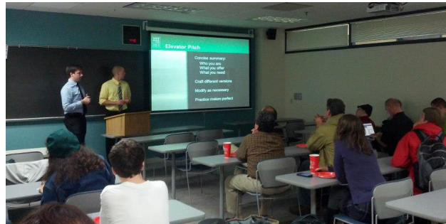
Representatives from Robert Half Inc. gave a presentation on "Landing your First Job in a Tough Economy"